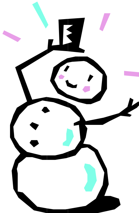
Where is the Michigan snow???

There have been many activities thus far and many more to come in this New Year! I would like to take this opportunity to thank all of the people who have made all the happenings possible!! I can't possibly name all of you, but there have been countless helpers who have chaperoned service opportunities, parents who have given of themselves to be here and share in the faith with our Confirmation students!! We have also had several parents who come in during the day to help with telephone calling, paperwork, copying and a variety of other tasks!! I would be remiss in my duties if I did not put out a very special THANK YOU to